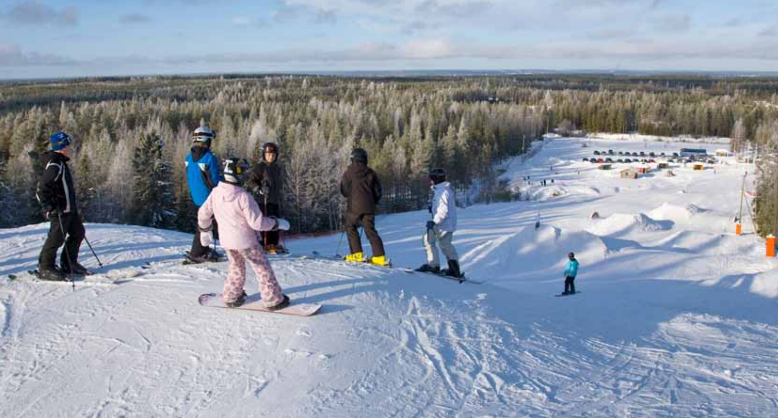
Parra ski center