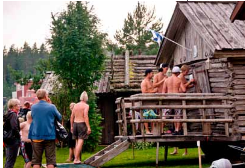
Mobile sauna festival